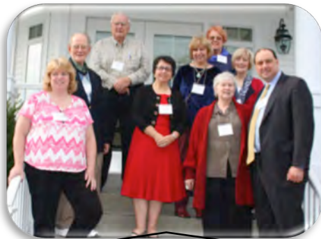
The Society Executive Board with Senator Eldridge