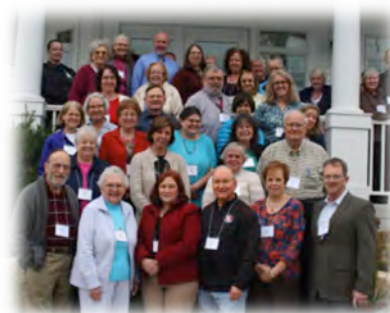
Middlesex Chapter Members