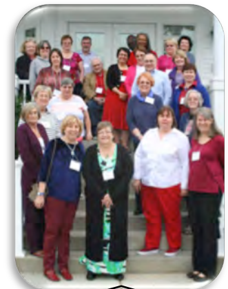
Merrimack Valley Chapter Members