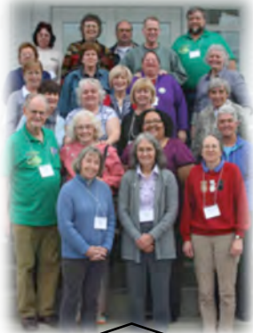
Bristol Chapter Members