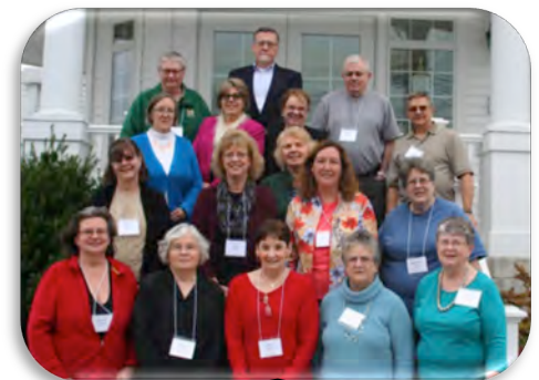
Worcester Chapter Members