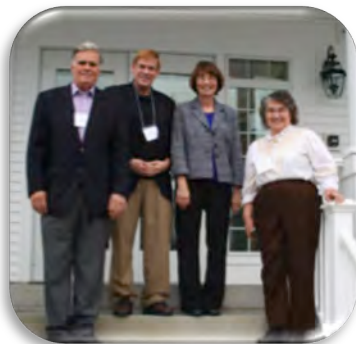
Martha's Vineyard Chapter Members